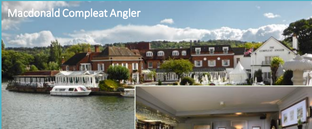
Macdonald Compleat Angler

The Thames is at its loveliest as it flows through this pleasant Georgian market town. with its prosperous shops, restaurants and bistros. The Macdonald Compleat Angler offers luxurious accommodation, next to the cascading waters of Marlow Weir. It is the perfect place to relax, by a roaring log fire, after a day exploring all the delights the local area has to offer.