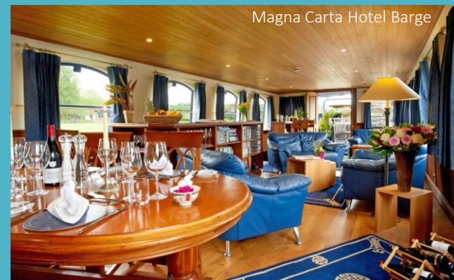
Magna Carta Hotel Barge

www.visitthames.co.uk/places-to-stay/boating-holidays