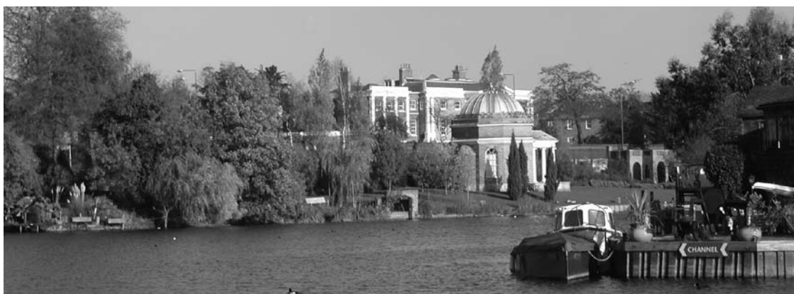
Garrick's Temple from Hurst Park between A and C