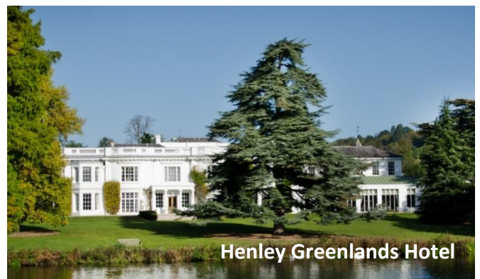
Henley Greenlands Hotel

Henley www.visitthames.co.uk/Henley-on-Thames Marlow www.visitthames.co.uk/Marlow