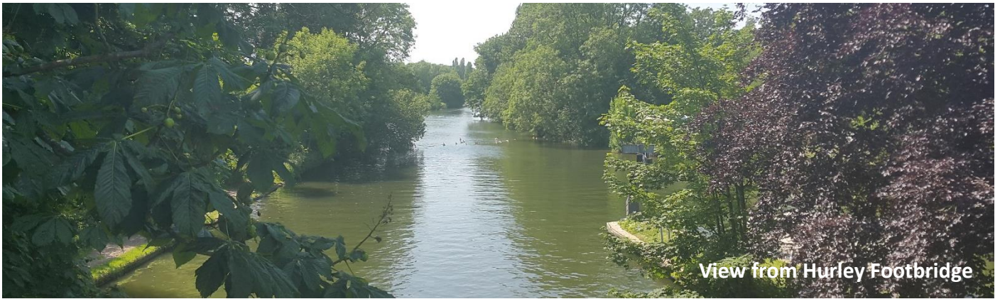
View from Hurley Footbridge

START at Higginson Park, Marlow. Marlow is one of the loveliest locations on the River Thames; the vibrant Georgian market town is made up of historic streets, an abundance of vintage and modern boutique shops, restaurants, cafes, bistros and pubs.